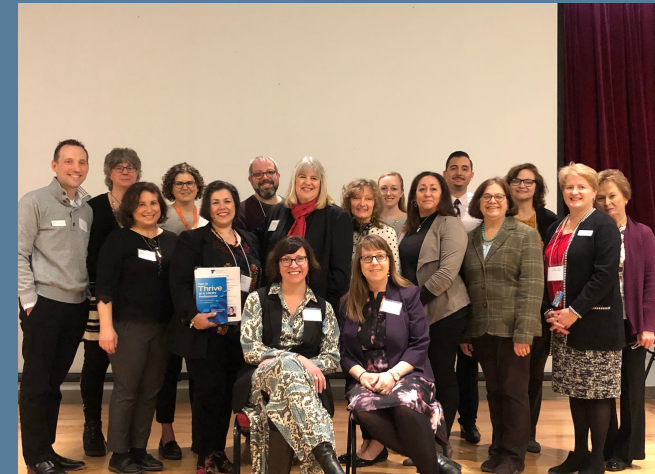
Mid-Winter Conference - February 2020