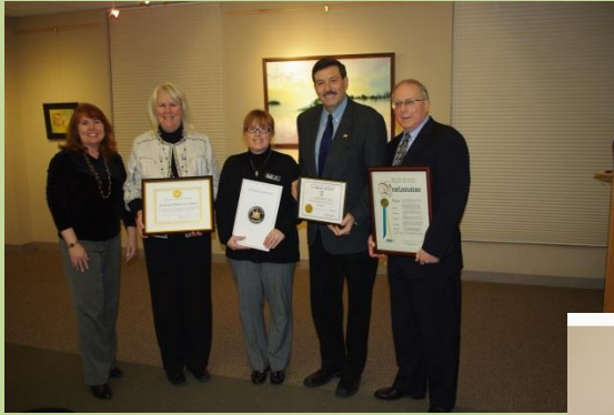
Joseph F. Shubert Library Excellence Award Highest NY State Award